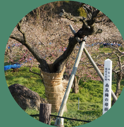
TAKADA KAEN, the Nankou Ume Mother Tree