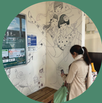
Minabe Train Station

Experience Ume Culture in a World Heritage Landscape