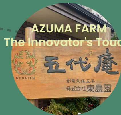
AZUMA FARM The Innovator's Touch